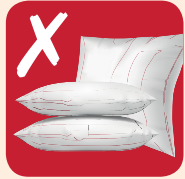
Pillows and duvets

Remember – Items must be clean, dry and in no more than one tied carrier bag placed next to your bin.