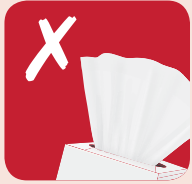
Tissues and wipes