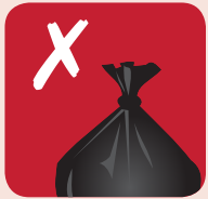
Black bin bags