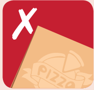
Greasy pizza boxes