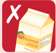
Food and drink cartons