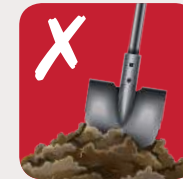
Soil and stones

Remember – Subscribe to the collection service – details online. Garden waste can be composted at home - order a discounted compost bin online at surreyep.org.uk .