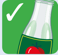
Glass bottles and jars