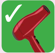
Anything with a plug