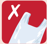
Plastic bags and cellophane