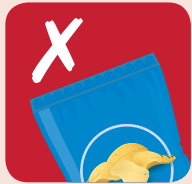
Crisp packets and wrappers