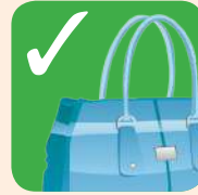
Bags and belts