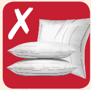
Pillows and duvets

Remember – Items must be clean, dry and in no more than one tied carrier bag placed next to your bin.