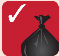
Carrier and bin bags