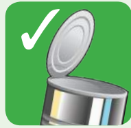
Metal tins and cans