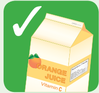
Food and drinks cartons