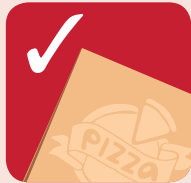
Greasy pizza boxes