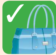
Bags and belts