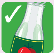
Glass bottles and jars