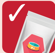
Plastic bags and food pouches