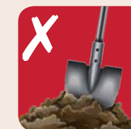
Soil and stones

Remember – Subscribe to the collection service – details online. Garden waste can be composted at home – order a discounted compost bin online at surreyep.org.uk