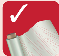
Plastic film and film lids