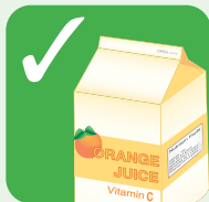
Food and drink cartons