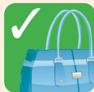
Bags and belts