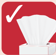
Used tissues and wipes