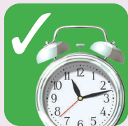
Anything battery- operated