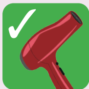
Anything with a plug