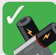
Batteries in a separate bag