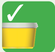
Plastic pots, tubs and trays