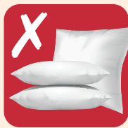
Pillows and duvets

Remember – Items must be clean, dry and in no more than one tied carrier bag placed next to your bin.