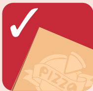
Greasy pizza boxes