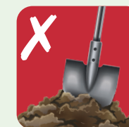
Soil and stones

Remember – You can subscribe for collections at guildford.gov.uk/gardenwaste where you'll also find details of how to buy a discounted compost bin.