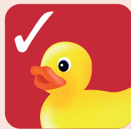
Hard plastics (toy)