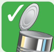
Metal tins and cans