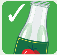
Glass bottles and jars