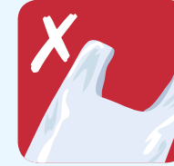
Plastic bags and packaging

Remember – flatten cardboard boxes. Make sure shredded paper is contained in a cardboard box, paper bag or envelope.