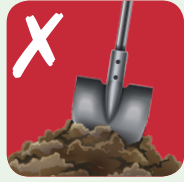
Soil and stones

Remember – you can subscribe to the collection service on our website, or order a discounted home garden waste composter at surreyep.org.uk