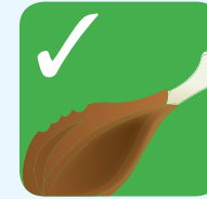
Meat and bones