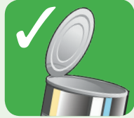
Tins and cans