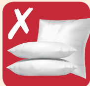
Pillows and duvets

Remember – items must be clean and dry and shoes should be in pairs and placed in a carrier bag.