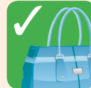
Bags and belts