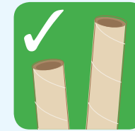
Other paper and card items