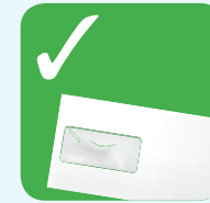
Magazines, envelopes and junk mail