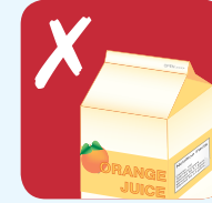
Food and drink cartons