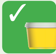
Plastic tubs and trays