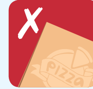
Greasy pizza boxes