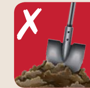
Soil and stones

Remember – To subscribe to the Biffa Green Waste Club call 0800 0858 286 or visit www.greenwasteclub.co.uk Garden waste can also be composted at home, order a discounted compost bin online at www.surreyep.org.uk