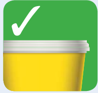
Plastic pots, tubs and trays