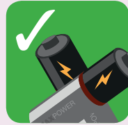
Batteries in a separate bag