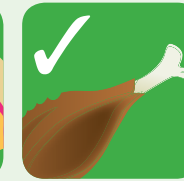
Meat and fish