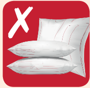
Pillows and duvets

Remember – Items must be clean, dry and in no more than one tied carrier bag placed next to your food waste caddy.