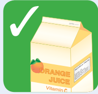
Food and drink cartons