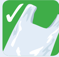
Empty plastic bags