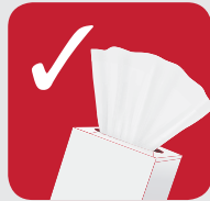
Tissues and wipes