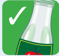
Glass bottles and jars