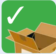
Card and cardboard