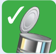
Metal tins and cans