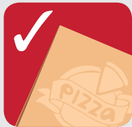
Greasy pizza boxes