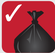
Black bin bags