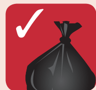
Black bin bags