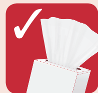
Tissues and wipes