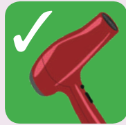
Anything with a plug