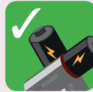
Batteries in a separate bag