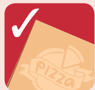
Greasy pizza boxes