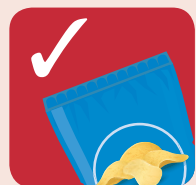
Crisp packets and wrappers