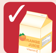
Food and drinks cartons