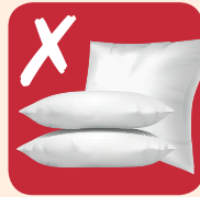
Pillows and duvets

Remember – Items must be clean, dry and in no more than one tied carrier bag placed next to your bin.