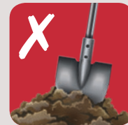
Soil and stones

Remember – Subscribe to the collection service – details online. Garden waste can be composted at home – order a discounted compost bin online at surreyep.org.uk .