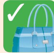
Bags and belts